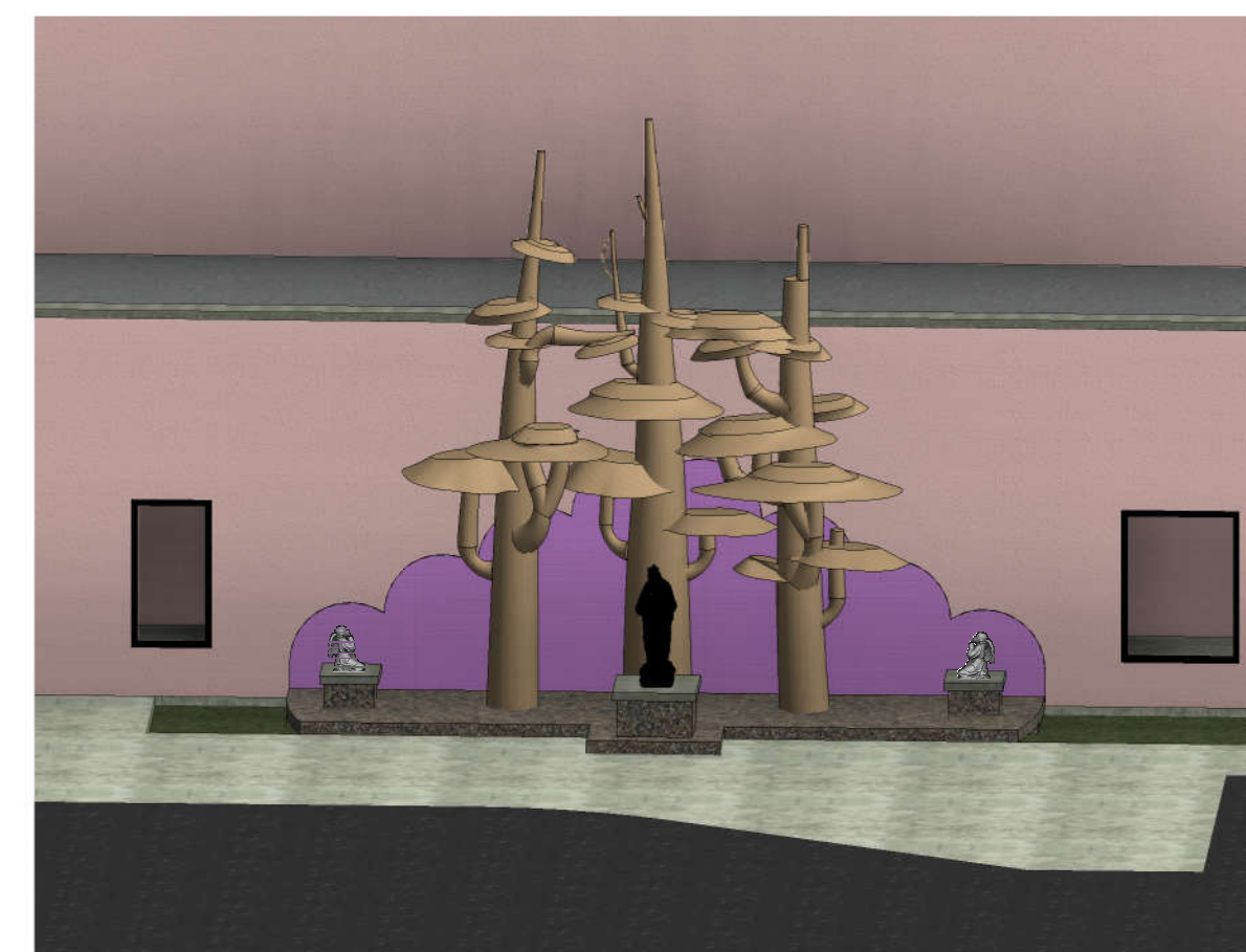
3 Rear 1.2