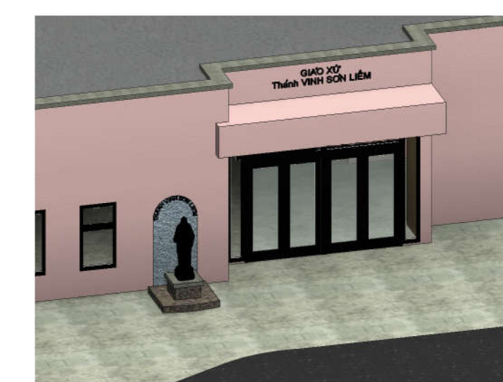
4 Rear 1.3